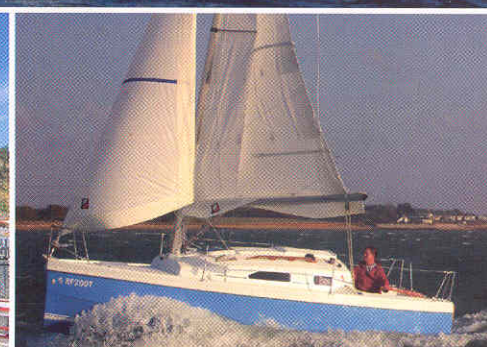
NEW BOAT TEST RED FOX TWIN KEELER