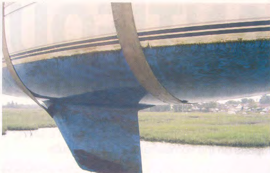
Meltemi III at season's end. The hull looks fouled but the slime came off with ease

CONTACT: Plastimo UK Ltd www.plastimo.co.uk Tel: 01489 778850