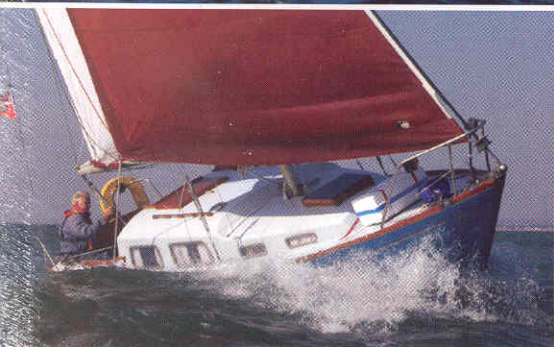
SECOND-HAND FOCUS GREAT DANE, 28

MAKE YOUR OWN TEAK DECKS • RENOVATE YOUR OUTBOARD • INSTALL AN EXHAUST OVERHEAT ALARM