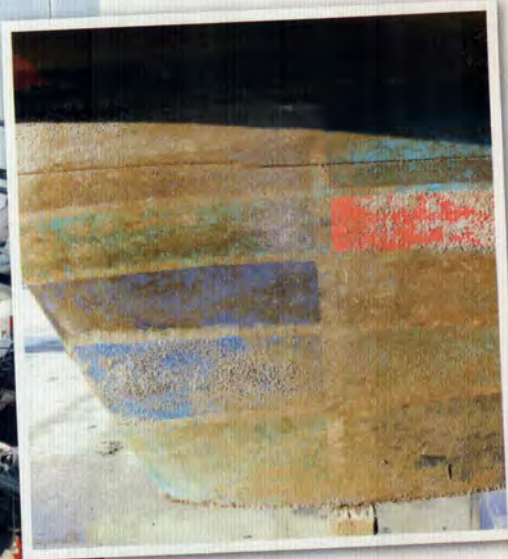
Above and left: having been immersed for eight months, the patchwork hull is lifted to compare and contrast results